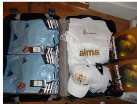
Signing sports equipment delivered to the headquarters of the Foundation with overflowing suitcases.