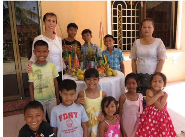
It is tradition that the children feed their parents in gratitude before going to donate at the pagoda.