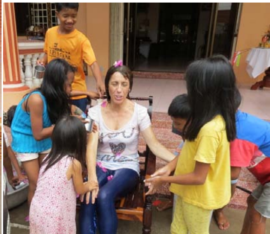
On the last day people have a bath of purification, forgiveness and renewal.