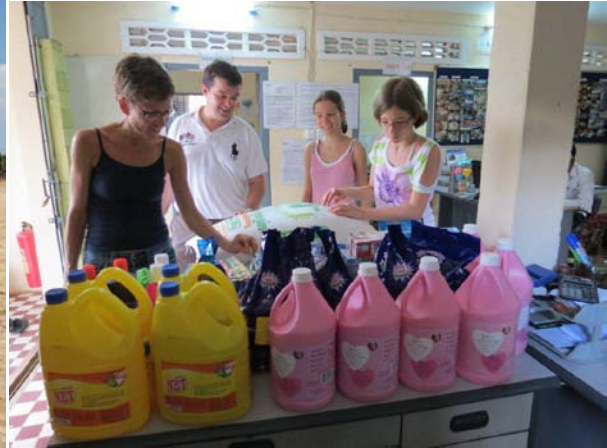
The complete family Deschutter visiting the Children's Land and making a personal contribution.